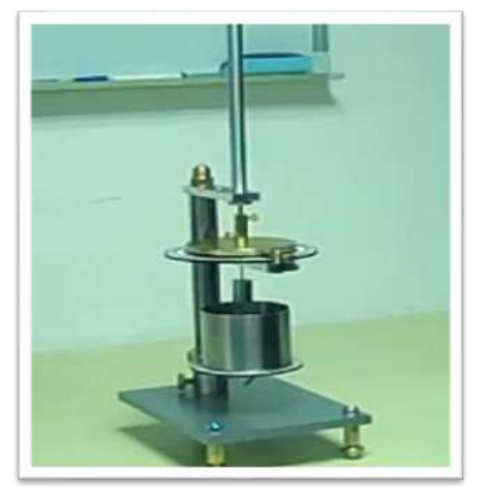
Figure 4.1: Torsional Viscometer

In this paper the kinematic viscosity of polymer solution mixtures were tested by using torsional viscometer shown in figure 4.1. It consists of a wire of standard diameter or gauge passing vertically through a cylindrical tube at the top. The free end of the wire at the bottom is attached to a circular disc, which rotates over a circular graduated disc, the cylinders of varying diameter can be fixed which is completely immersed in the solution. The solution container may be placed over a platform which can be lowered or raised by means of guides over a vertical stand. By rotating the flywheel of one complete revolution in the clockwise direction standard graph of redwood seconds viscosity angular motion in degrees or different diameter of cylinders and corresponding gauge of wire is noted. The solution polymers are tested for viscosity measurements viscometer readings were taken for different temperatures at different percentage of polymers and also PVP and PVA are blended with constant stirring to form a homogeneous mass of equal percentage. Finally the viscosity is compared with individual polymer and for the combination.