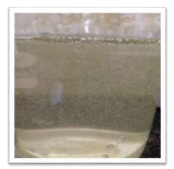
Figure 3.1: Insulation gel

PVP and PVA can be obtained in different grades, densities, molecular weights. Depending upon their molecular weights K values are expressed for PVP which are derived from relative viscosity measurements represents a function of the average molecular weight. The PVP K-15 and K-30 concentrations are less than 10% have little effect on viscosity in aqueous solution, whereas K-60 and K-90 considerably influence flow properties. This paper work is done by selecting PVP K-90 and PVA. The selected polymers PVP and PVA are supplied by N Shashikant& Co., Mumbai. Initially different molecular weight of polymers are readily soluble in water and it is heated in warm water by adding slowly with stirring using a magnetic stirrer with different rpm until a homogenous mixture is obtained to form a gel type solution as shown in figure 3.1, in all the preparation the volume of water is kept constant and percentage weight of polymer is varied from 5% to 20%. The same method is followed for different molecular weight of the polymers.