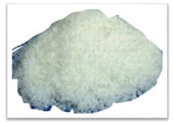
Figure 2.2: Polyvinyl alcohol Powder

ISSN: 2277-9655 Impact Factor: 5.164 CODEN: IJESS7