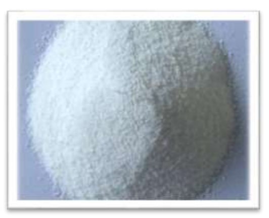
Figure 2.1: Polyvinylpyrrolidone Powder

Polyvinylpyrrolidone (PVP) is a chain polymer of vinyl and pyrrolidone, developed in the late 1930's. PVP is obtained by a multistep synthesis that concludes by polymerization of vinylpyrrolidone in aqueous solution in the presence of hydrogen peroxide [3]. PVP is a white hygroscopic powder shown in figure 2.1, and unlike many synthetic polymers is soluble in a variety of traditional solvents such as water, chlorinated hydrocarbons, alcohols, amides, and amines. The interactions between the carbonyl groups in PVP and the hydroxyl group in polyphenols are well known. Due to these interactions PVP is used to isolate poly phenols. PVP formulations have been used to produce desired solution viscosity, allowing the deposition of a uniform coating thickness of a photo resist in the manufacture of high resolution display screens [4].